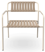
Lounge Armchair Gelato Nacar + Slats Duna 06951