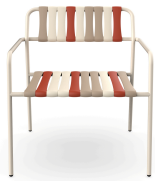
Lounge Armchair Gelato Amarena Nacar 06923