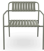
Lounge Armchair Gelato Salvia + Slats Salvia 06976