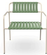
Lounge Armchair Gelato Nacar + Slats Olivo 06950