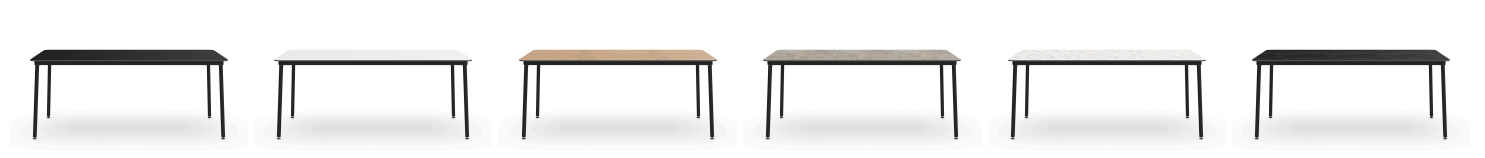
Black Hub Table 180x90 Hpl Black 06351 Black Hub Table 180x90 Hpl White 06352 Black Hub Table 180x90 Hpl Natural Oak 06353 Table Hub Black 180x90 Hpl Cement 06354 Table Hub Black 180x90 Hpl White Marble 06355 Black Hub Table 180x90 Hpl Black Marble 06356