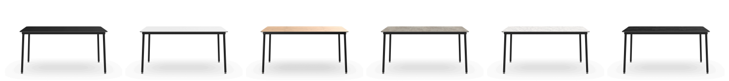
Table Hub Black 150x90 Hpl Black Hub Table 150x90 Hpl Table Hub Black 150x90 Hpl Table Black Hub 150x90 Hpl Table Hub Black 150x90 Hpl Table Hub Black 150x90 Hpl Black 06343 White 06344 Natural Oak 06345 Cement 06346 White Marble 06347 Black Marble 06348