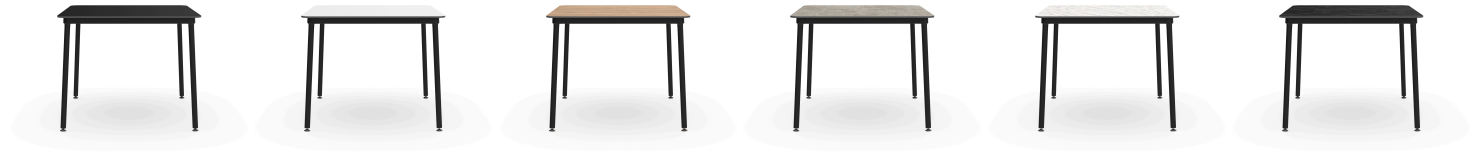
Black Hub Table 90x90 Hpl Black 06335