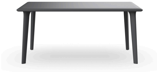
New Dessa 160x90 Table Dark Grey 03946