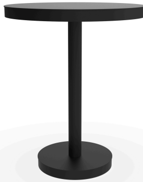
Barcino Black Table Ø60 Central Leg 01432