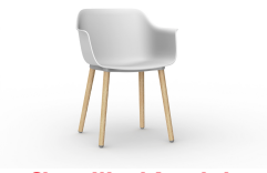
Shape Wood Armchair 05309