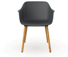
Shape Wood Armchair Dark Grey 05312