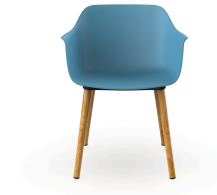
Shape Wood Armchair Retro Blue 05313