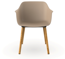
Shape Wood Armchair Sand 05311