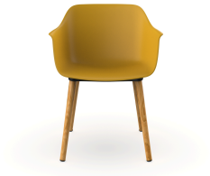
Shape Wood Armchair Tuscan 05314