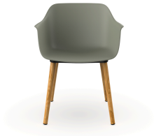
Green-Grey Shape Wood Armchair 05310