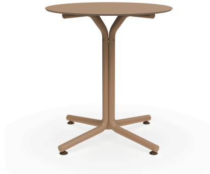
Bini Table Sand Hpl Sand Ø70 06638