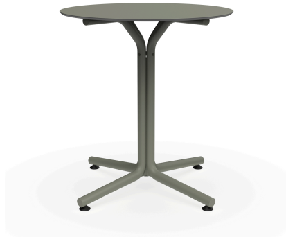
Bini Table Green Grey Hpl Green Grey Ø70 06074