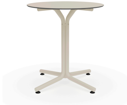
Bini Table Ivory Hpl Ivory Ø70 06075