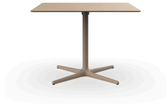
Sand Toledo Table 100x100 06608