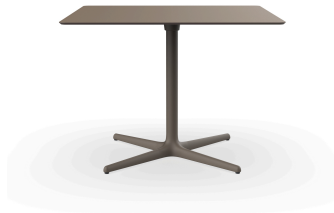
Toledo XI Table 100x100 Chocolate 05879