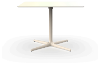
Toledo XI Table 100x100 Ivory 05880