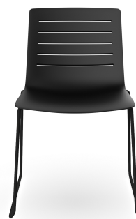
Skin Black Sled-Base Chair 06718