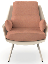
Anou Sofa Nacar Amber 07063