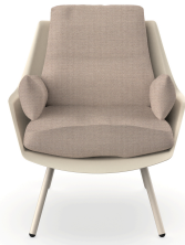
Anou Sofa Nacar Mud 07062