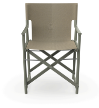
Boss Salvia Chair Limonetto Fabric 06824