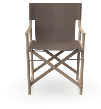
Boss Duna Chair Mocha Fabric 06825