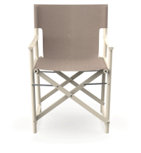
Boss Nácar Chair Mud Fabric 06827