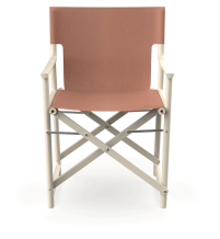
Boss Nácar Chair Amber Fabric 06826