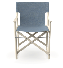
Boss Nácar Chair Denim Fabric 06828