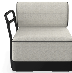
Brisa Terminal Noche Cushion Salina 05 + Dolce 55 06883