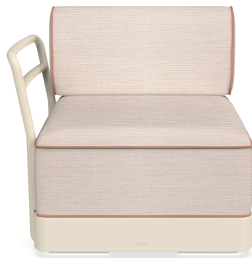
Brisa Terminal Nacar Cushion Hazelnut + Amber 06881