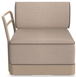
Brisa Terminal Duna Cushion Mud+Mocha 06880