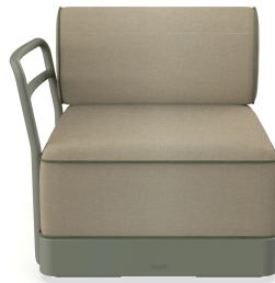
Terminal Brisa Salvia Cushion Limonetto + Fern 06882