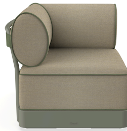
Brisa Corner Salvia Cushion Limonetto + Fern 06799