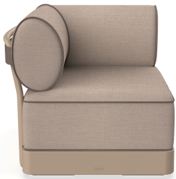
Brisa Corner Duna Cushion Mud + Mocha 06797