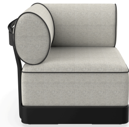
Brisa Corner Noche Cushion Salina 05 + Dolce 55 06800