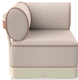
Brisa Corner Nacar Cushion Hazelnut + Amber 06798