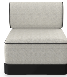
Brisa Basic Noche Salina 05 Cushion + Dolce 55 06796