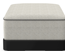
Brisa Ottoman Night Cushion Salina 05 + Dolce 55 06792