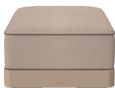
Brisa Ottoman Duna Cushion Mud + Mocha 06789