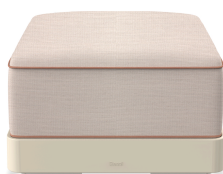
Brisa Ottoman Nacar Hazelnut Cushion + Amber 06790