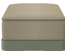
Brisa Ottoman Salvia Cushion Limonetto + Fern 06791