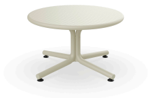
Ivory Bini Lounge Table 05400