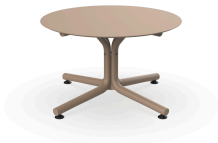
Bini Lounge Table Ivory Hpl Sand 06639