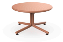
Terracotta Bini Lounge Table 05401