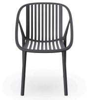
Bini Chair Dark Grey 05376