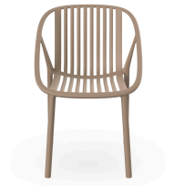
Bini Chair Sand 05381