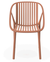
Bini Chair Terra Cotta 05379