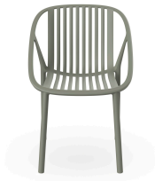
Bini Chair Green-Grey 05377