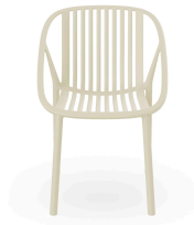
Bini Chair Ivory 05378