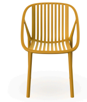
Bini Chair Tuscan 05380