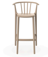
High Woody Sand Barstool 05449