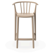
Medium Woody Sand Barstool 05457