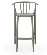
High Woody Green-Grey Barstool 05448