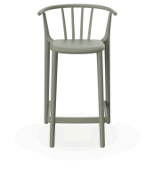
Medium Woody Green-Grey Barstool 05456