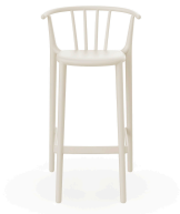
High Woody Ivory Barstool 05444