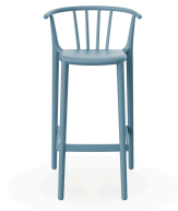
High Woody Retro Blue Barstool 05447