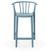
Medium Woody Retro Blue Barstool 05455