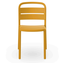
Como Chair Tuscan 05348