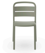
Como Chair Green-Grey 05345