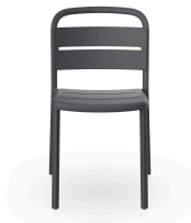
Como Chair Dark Grey 05344