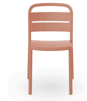
Como Chair Terra Cotta 05347