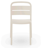
Como Chair Ivory 05343