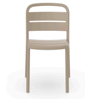
Como Chair Sand 05346