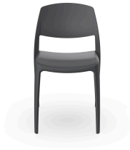
Smart Dark Grey Chair 05365