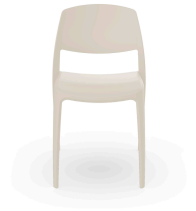
Smart Chair Ivory 07114