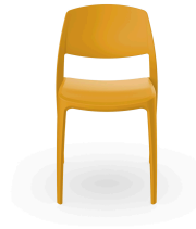
Smart Tuscan Chair 05369