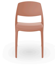
Smart Terra Cotta Chair 05368