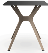
Phenolic Black Table 70x70 Vela &quot;s&quot;; Sand Table Foot 03062