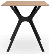
Hpl Natural Oak Table 70x70 Vela &quot;s&quot;; Black Table Foot 04059