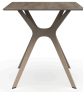
Hpl Ashen Oak Table 70x70 Vela &quot;s&quot;; Sand Table Foot 04061