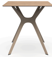
Phenolic Natural Oak Table 70x70 Vela &quot;s&quot;; Sand Table Foot 04062