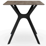
Hpl Ashen Oak Table 70x70 Vela &quot;s&quot;; Black Table Foot 04058