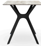
Hpl Washed Wood Table 70x70 Vela &quot;s&quot;; Black Table Foot 04057