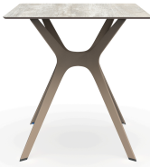
Phenolic Washed Wood Table 70x70 Vela &quot;s&quot;; Sand Table Foot 04060