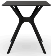
Phenolic Black Table 70x70 Vela &quot;s&quot;; Black Table Foot 03059