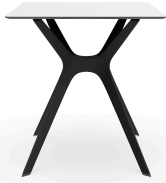
Phenolic White Table 70x70 Black Vela &quot;s&quot;; Leg 03058