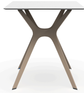
Phenolic White Table 70x70 Vela &quot;s&quot;; Sand Table Foot 03061