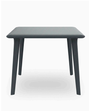
New Dessa 90x90 Table Dark Grey 03944