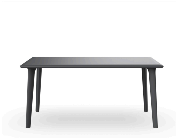
New Dessa 160x90 Table Dark Grey 03946