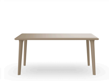
New Dessa 160x90 Table Sand 03947