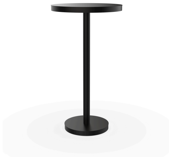
Barcino Black Table Ø60 High Central Leg 01434