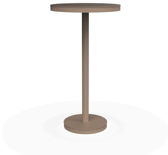
Barcino Sand Table Ø60 High Central Leg 01433