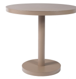
Barcino Sand Table Ø80 Central Leg 01423