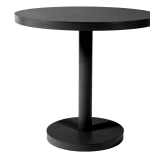
Barcino Black Table Ø80 Central Leg 01424