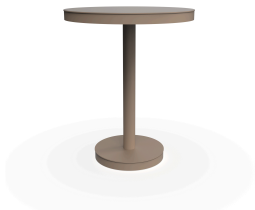
Barcino Sand Table Ø60 Central Leg 01431