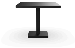
Barcino Black Table 90x90 Central Leg 01422