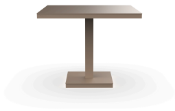
Barcino Sand Table 90x90 Central Leg 01421