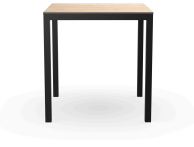
Barcino Compact Natural Oak/Black Table 70x70 04023