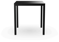
Barcino Black Table 70x70 01403