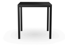
Barcino Compact Black/Black Table 70x70 03031