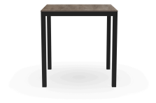
Barcino Compact Ashen Oak/Black Table 70x70 04022