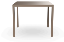
Barcino Sand Table 90x90 01400