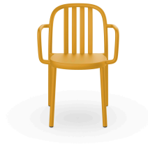
Sue Lamas Armchair Tuscan 05177