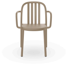
Sue Lamas Armchair Sand 05175