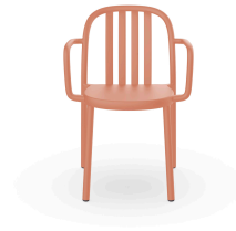
Sue Lamas Armchair Terra Cotta 05178