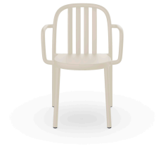
Sue Ivory Armchair 07142