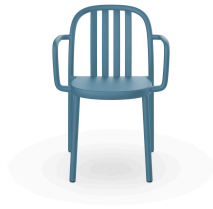
Sue Lamas Armchair Retro Blue 05176