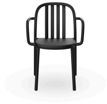
Sue Lamas Armchair Black 05174