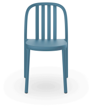
Sue Lama Chair Retro Blue 05170