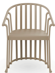
Sand Raff Armchair 04908