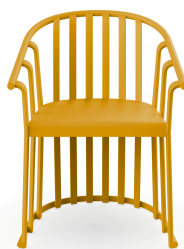
Toscano Raff Armchair 04912