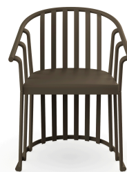
Chocolate Raff Armchair 04913