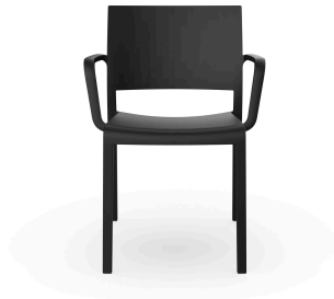
New Fiona Armchair Black 03542