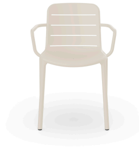
Gina Ivory Armchair 07144