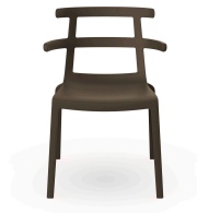
High Tokyo Chocolate Chair 01621