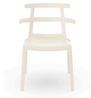
High Tokyo Ivory Chair 01617