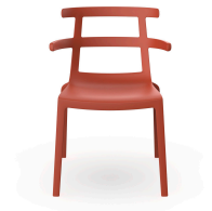
Tokyo Greda Chair 07207