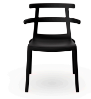
High Tokyo Black Chair 01626