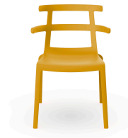
High Tokyo Tuscan Chair 01624