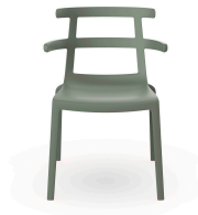
High Tokyo Green-Grey Chair 01620