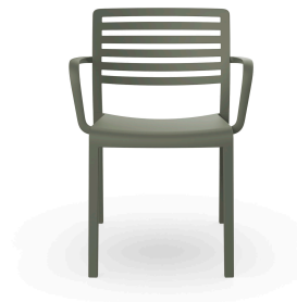
Lama Armchair Green-Grey 07055