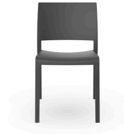
Fiona Chair Dark Grey 01802