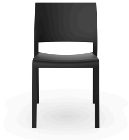
Fiona Chair Black 00764