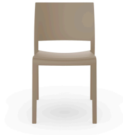
Fiona Chair Sand 00950